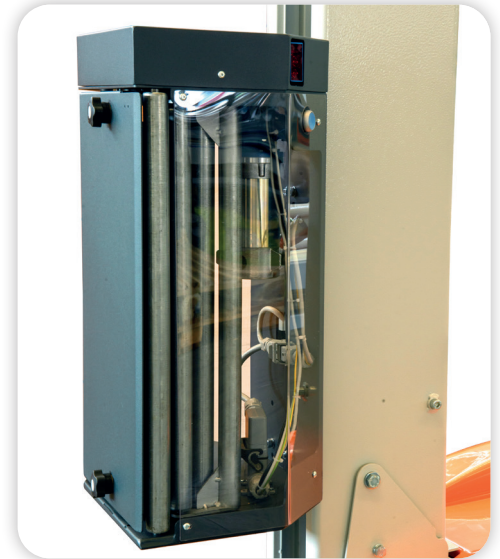
FILM TENSIONING WITH MOTORIZED PRE-STRETCH 100% - 150% - 200% - 250%