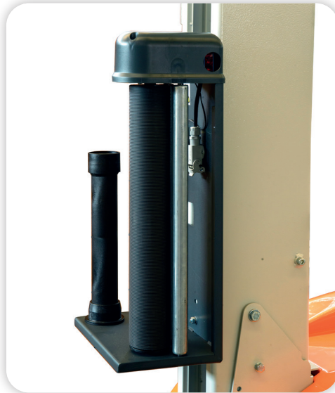
FILM TENSIONING WITH ELECTROMAGNETIC BRAKE