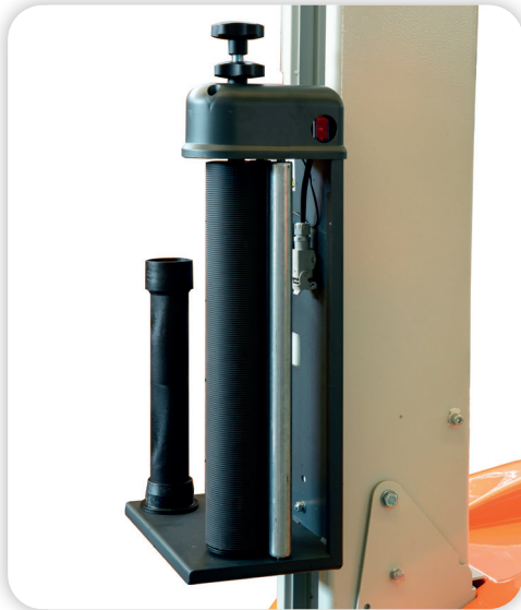
FILM TENSIONING WITH MECHANICAL BRAKE